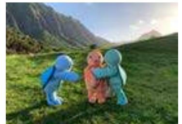
ANA Flying Honu, Inflight Video