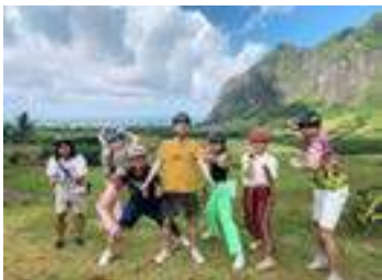
2019 Ariyoshi no Natsu Yasumi