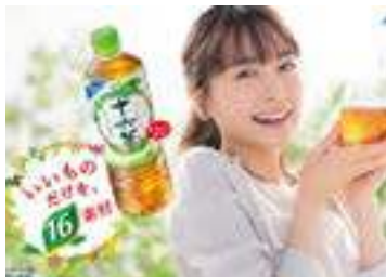
2011 Jurokucha Commercial